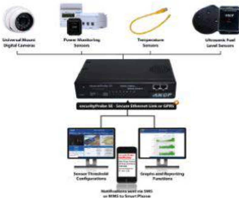
securityProbe 5ESV Example Notification

Up to 8 of AKCP's Intelligent Sensors can be connected to the securityProbe 5E-X20. When plugged in, the sensor automatically configures itself and goes online. Using the either the E-sensor 8, or the E-opto 16 expansion modules, up to 500 sensors can be connected to a single unit. Our easy-to-use web based interface allows you to setup the securityProbe 5E-X20 within minutes. When online, the sensors use their 4 levels of threshold checking and report any status change.