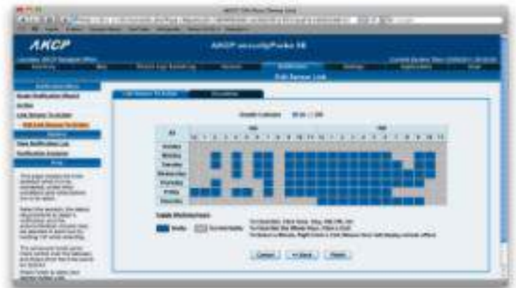
False Message Filters via Calendar Setups

In order to prevent false alarms, the SEC 5E-X20 allows extensive filtering of events. You can limit events based on the time of day or the day of the week. You can also limit the number of alerts per hour, so that you are not swamped with many messages. This is especially important with the sensor like the motion detector where you may want to process an event only when the business premises are closed.